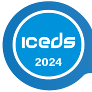
TABLE OF CONTENTS ICEDS 2024